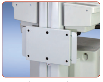
Sharps Bracket (Available for side mount)