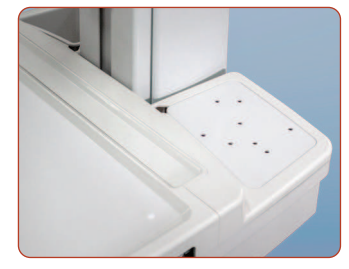
Pre-Drilled Rear Bin Scanner Plate