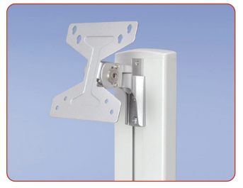
Height Adjustable Tilt Swivel Monitor Mount