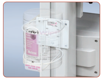
Sanitizing Wipes Bracket