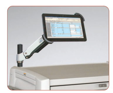
Tablet Holder assembly

Ask your Capsa representative about additional computer mounting solutions.