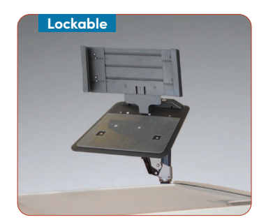
Laptop Security Tray assembly, metal

All Capsa medication and procedure carts can be equipped for mobile computing. We offer mounting systems for laptop, All-In-One, and hardware for top or back-mounting.