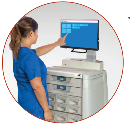
Full-size touchscreen interface and flexible software design support configurable workflows and dispensing protocols