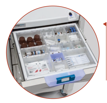
Intuitive pick-tolight functionality assures simplicity and accuracy during med administration, especially narcotics

NexsysADC is ideal for medication management, security, and inventory tracking in surgery centers. This simple, secure system fully manages the onsite storage of controls and high-value supply items, but at a fraction of the price of alternative automated cabinets.