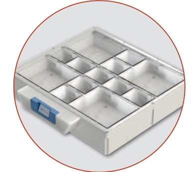
12 CAM configurations to lock up to 25 SKUs, with tamper evidence