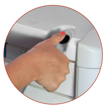
Advanced security including prox card and biometric authentication