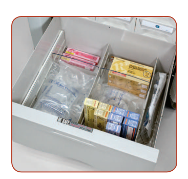
3 Bulk Supplies & Kits Bulk supplies, kits, and larger items are stowed neatly in configurable, locked supply drawers, with pick-to-light guidance.

Meds and surgery supplies are efficiently managed in dividable, locked openmatrix bins, with pick-tolight guidance.