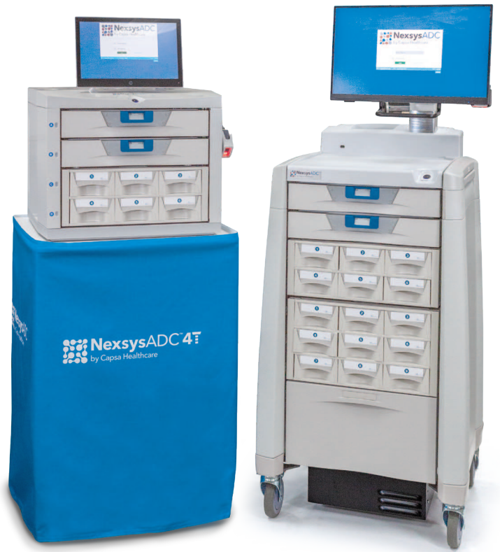
NexsysADC is available in 4T countertop and main cabinet models.

Every facility's patient population and medication management needs are unique, so each NexsysADC unit is highly adaptable and scalable to manage a few SKUs, up to hundreds. Ask your Capsa Representative or your pharmacy provider for a detailed analysis.