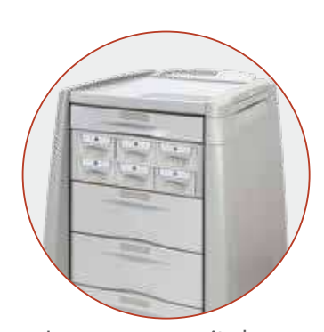
Increase capacity by connecting 1 or more auxiliary cabinets