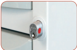
Core Removable Lock