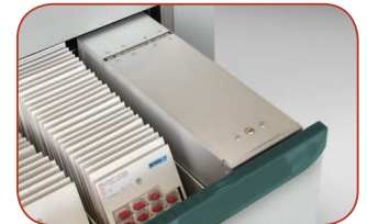
10" Narcotic Storage*