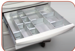
Drawer Flex System