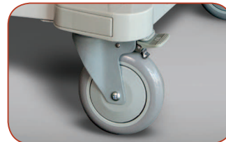
5" Brake Caster*