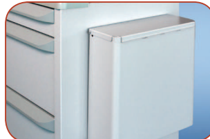
Waste with Lid