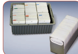
Punch Card Exchange Bins