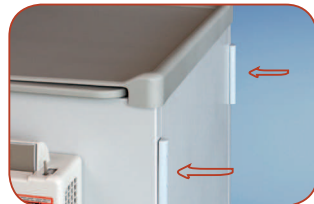
Chair Rail Bumpers*