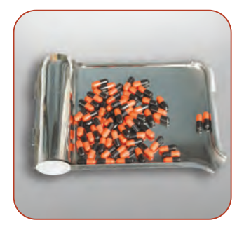
Eliminate inaccurate, inefficient manual counting.