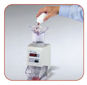
Count almost any tablet or capsule accurately & quickly.