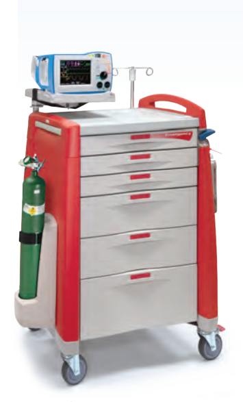
Avalo® Emergency Cart

High-level care depends on easy access to the right instruments and supplies when needed. Capsa Healthcare puts everything at your fingertips with a complete line of configurable medical carts. Organize and mobilize all supplies with ample capacity, security options, and durable construction.