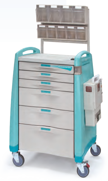
Avalo® Anesthesia Cart