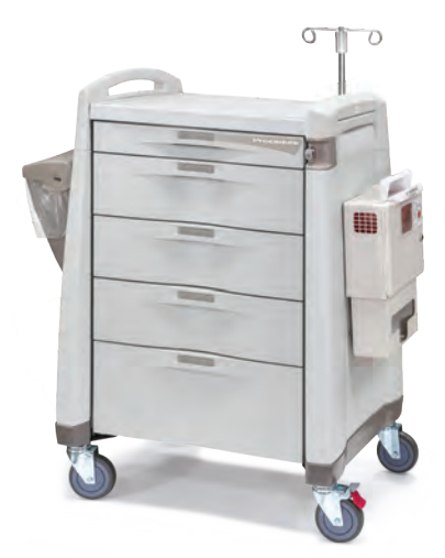
Avalo® Treatment Cart