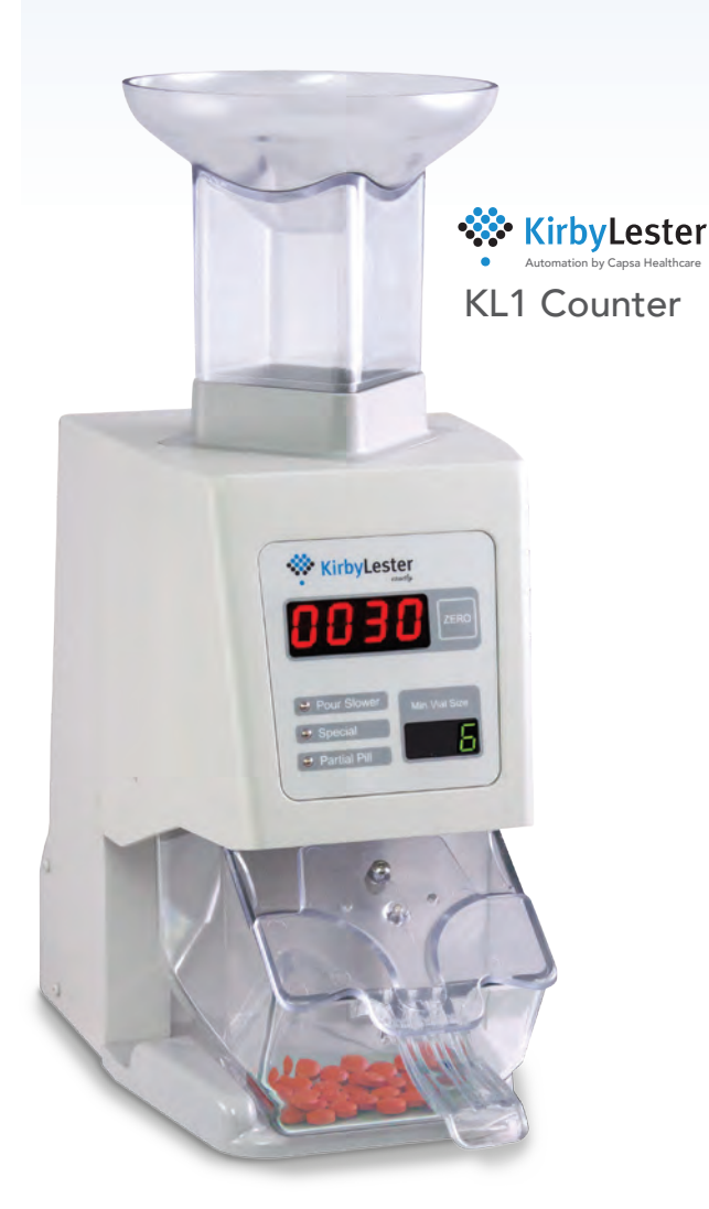
Simple Inventory Counting: KL1