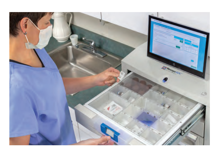
With guided-access technology, NexsysADC 4T helps clinicians get the exact dose needed, automatically log the transaction and update the inventory, and proceed with what they are best at: patient care.

At all times, you know inventory levels, who is accessing the cabinet, and what is dispensed for a specific patient or procedure. Your clinic will have secure medications, deter diversion, gain a fast return on investment, and stay ahead of DEA audit concerns.