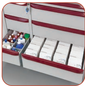
Maximum capacity 900 punch cards.

Height is floor to work surface. Standard drawers are 3"(d) and 10"(d). Accommodates full and half card sizes, plus liquids & supplies.