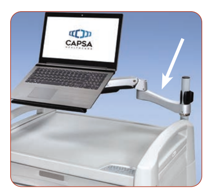
AX Series fixed link extension