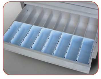
Stor-Flex™ Bin/Fixed Rail System

M-Series accommodates virtually all popular compliance packaging systems, such as Parata®/ TCGRx®, Omnicell®, Dispill®, SynMed® and Opus®