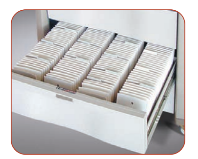
Offers a practical capacity of 450 punch cards plus room for liquids and supplies. Maximum capacity 600 punch cards.