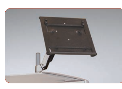
Laptop Tray assembly, plastic, 13" x 13" Holds up to 15" laptop