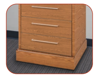
Skirted Base (non-mobile)