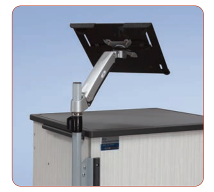
AX Series arm & rear mount