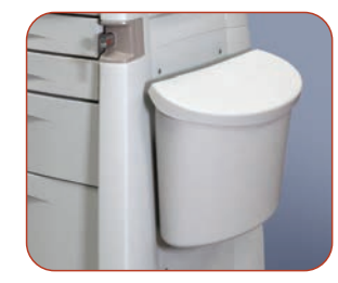
Waste with Lid*