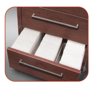
Maximum capacity 450 punch cards.