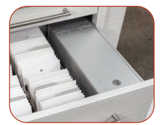
10" Narcotic Box*