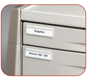
Drawer ID Label