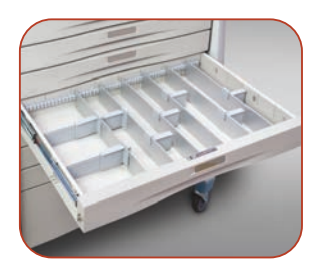
Drawer Flex System