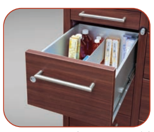
Narc Drawer (VE5, VE6 only)