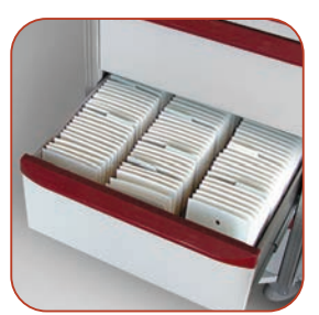
Maximum capacity 450 punch cards.