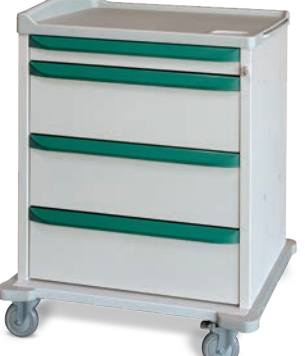
Model M4-PC 43"(h) 26.7"(d) 36.1"(w)