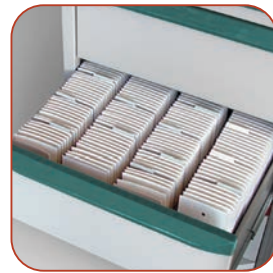
Maximum capacity 600 punch cards.