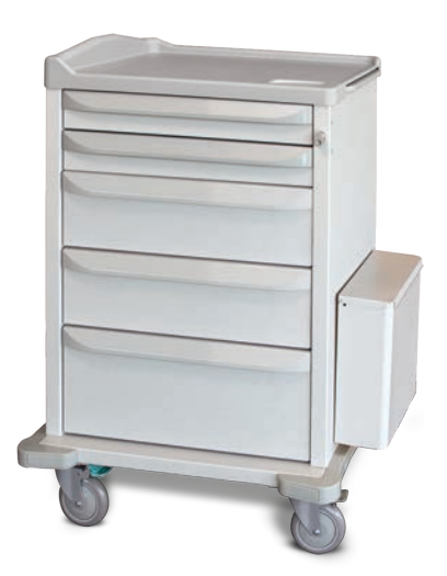
M-Series M3-TC 40.1"(h) 25.2"(d) 28"(w)

Vintage Encore VE3-TC 40.1"(h) 25.2"(d) 28"(w)