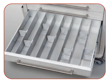
*Stor-Flex is a customizable patient medication organization system, with optional transfer trays and totes