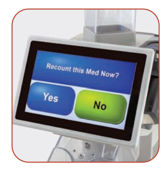
Keep a record of Rx fills and inventory (viewable on user portal)