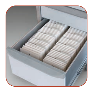
Maximum capacity 300 punch cards.