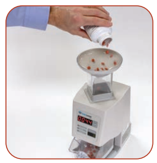
Count almost any tablet or capsule accurately & quickly