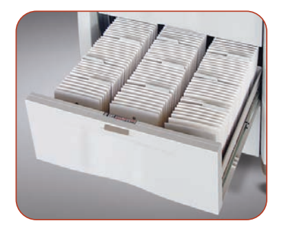
Offers a practical capacity of 350 punch cards plus room for liquids and supplies. Maximum capacity 450 punch cards.

Height is floor to work surface. Standard drawers are 3"(d) and 10"(d). Accommodates full and half card sizes, plus liquids & supplies.