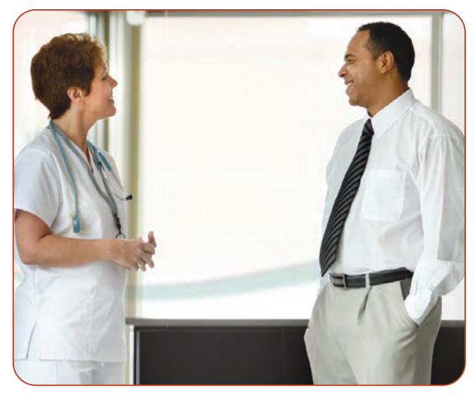
Working in concert with your pharmacy staff and facility management team is what helps Capsa Healthcare deliver long-term customer satisfaction.

for more detailed information about Capsa's warranty and service programs.