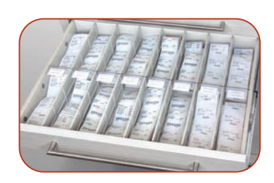
Vintage Encore accommodates virtually all popular compliance packaging systems, such as Parata®/TCGRx®, Omnicell®, Dispill®, SynMed® and Opus®