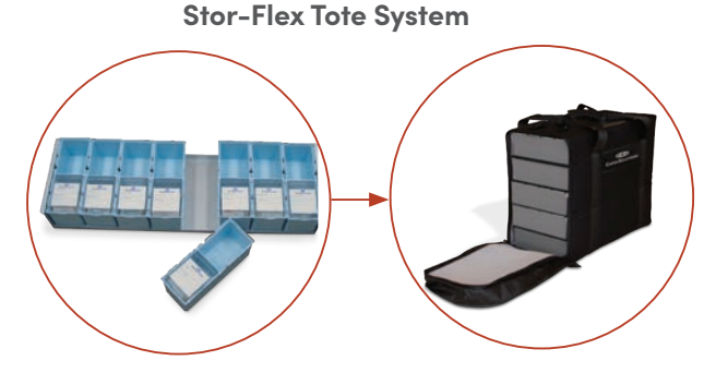
Large bin perfect for 7-day med cassette systems