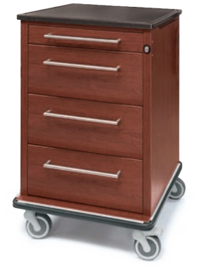
Model VE4x-PC 44"(h) 25.2"(d) 41.4"(w)