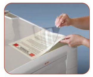
Clear Top Mat