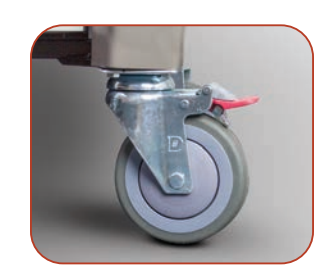
5" Brake Caster*