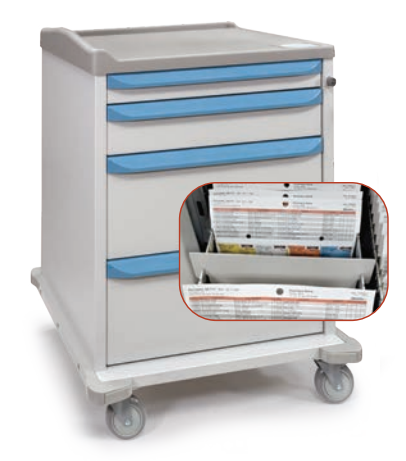
M-Series M4-DP 43.5"(h) 25.2"(d) 34.7"(w)