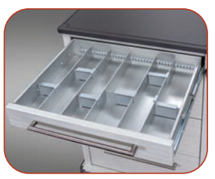
Drawer Flex System