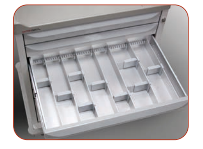
*Stor-Flex is a customizable patient medication organization system, with optional transfer trays and totes