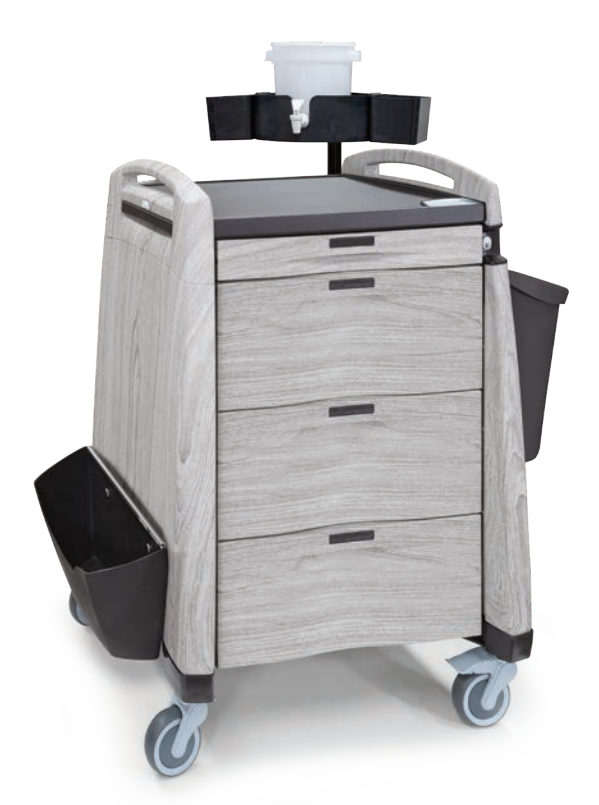
PCS punch card cart shown in Mountain Ash with optional accessories