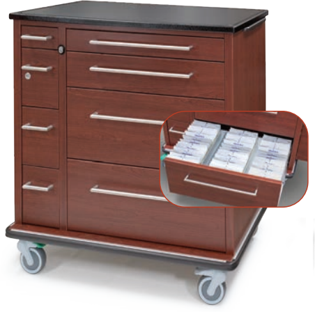
Vintage Encore VE5-DP 44"(h) 25.2"(d) 44.7"(w)