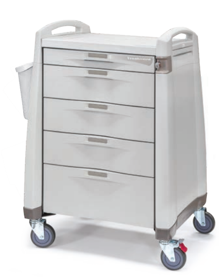
Avalo® Series (3 Heights) Standard 42.5"(h) 24"(d) 31"(w) Intermediate 39.5"(h) 24"(d) 31"(w) Compact 36"(h) 24"(d) 31"(w)