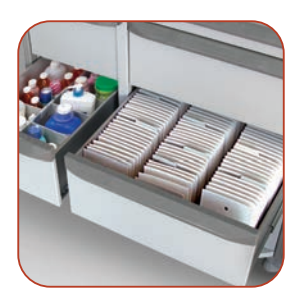
Maximum capacity 750 punch cards.