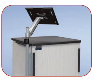
Laptop Arm & Tray