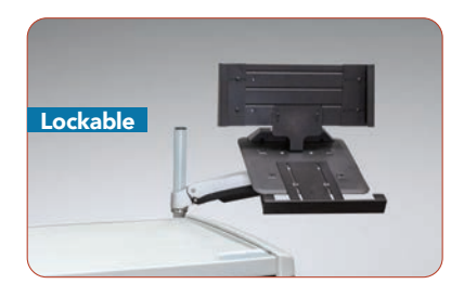
Laptop Security Tray assembly, metal Holds laptops 9"-16.5"