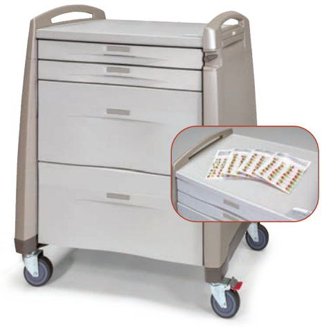
Avalo® AVDPL 43.75"(h) 24"(d) 38"(w)