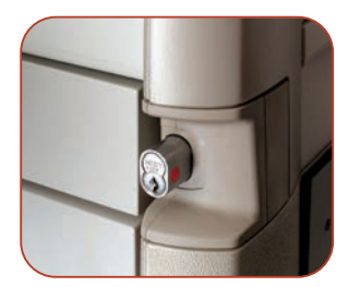
Core Removable Lock*

* Included on all Avalo Medication Carts. S & L Models also include Slide-Out Surface. XL Model includes Tracking Caster.