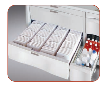
Offers a practical capacity of 600 punch cards plus room for liquids and supplies. Maximum capacity 750 punch cards.