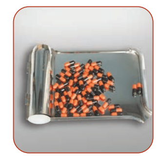
Eliminate inaccurate, inefficient manual counting