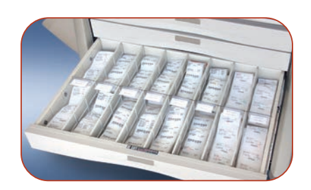
Avalo accommodates virtually all popular compliance packaging systems, such as Parata®/ TCGRx®, Omnicell®, Dispill®, SynMed® and Opus®