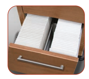
Maximum capacity 300 punch cards.