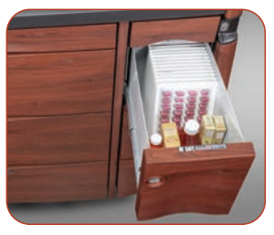
Narcotic Drawer (XL only)