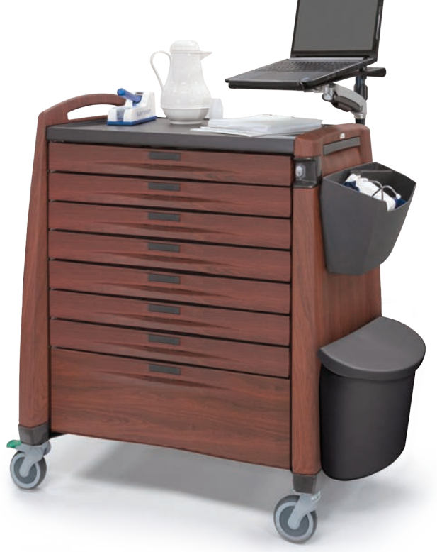
UDL automated packaging cart shown in Northern Cherry with optional accessories