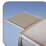
Slide-Out Work Surface