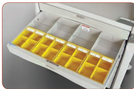
VersaBin modules available in 3 different sizes.