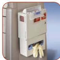
Sharps / Gloves

Streamlined clinical workflow is assured with a full complement of convenience accessories & organizing supplies to facilitate patient care.