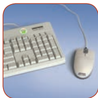
Infection Control Peripherals