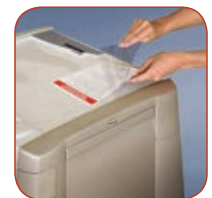
Clear Top Mat