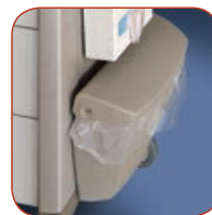
Waste Container With Lid